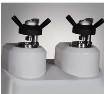
Mould cover ECOPRESS 200