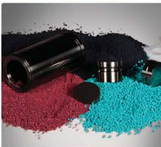
Mould cylinder, upper ram, lower ram