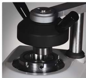
Bayonet mould closure