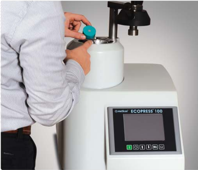
Consistent results with programmable parameters