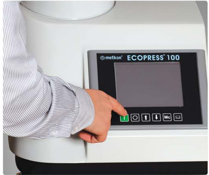
Easy and comfortable operation