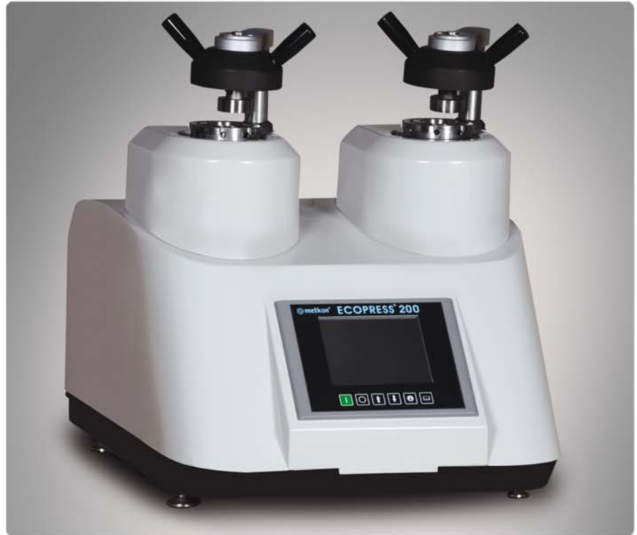
ECOPRESS 200 with dual cylinders