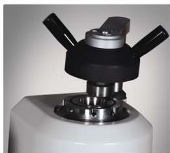
Mould cover ECOPRESS 100