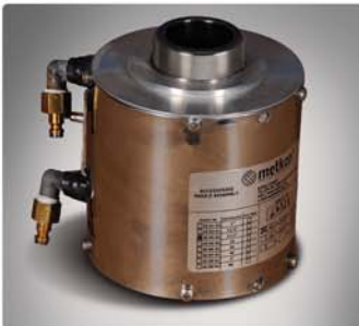
Heater / Cooler Assembly

The high efficiency combined heater/cooler is housed in the upper part of ECOPRESS. With 1250 W of thermostatically controlled heating power, molding times are kept to a minimum. At the end of the heating cycle the cooling water is automatically switched on and will turn off once the "Cooling Temperature" is reached. When the stand-by mode is switched on, pre-warming maintains a constant ready to use temperature, thus reducing the cycle time. Two cooling modes are available as "Standard" and "Low". Low cooling is for thermoplastic resins which require far longer cooling times for best mount clarity. A stainless steel "Recirculating Cooling Unit" is optionally available.