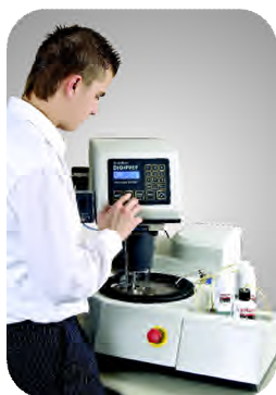
DIGIPREP 250 Preparation system