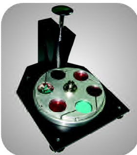
Levomat Specimen Loading Fixture to level specimens for central force specimen holders.