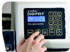
DIGIPREP 300 with DOSIMAT Peristaltic Dispenser (Top) Front Panel with LCD display (Above)