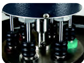
Individual Force Application